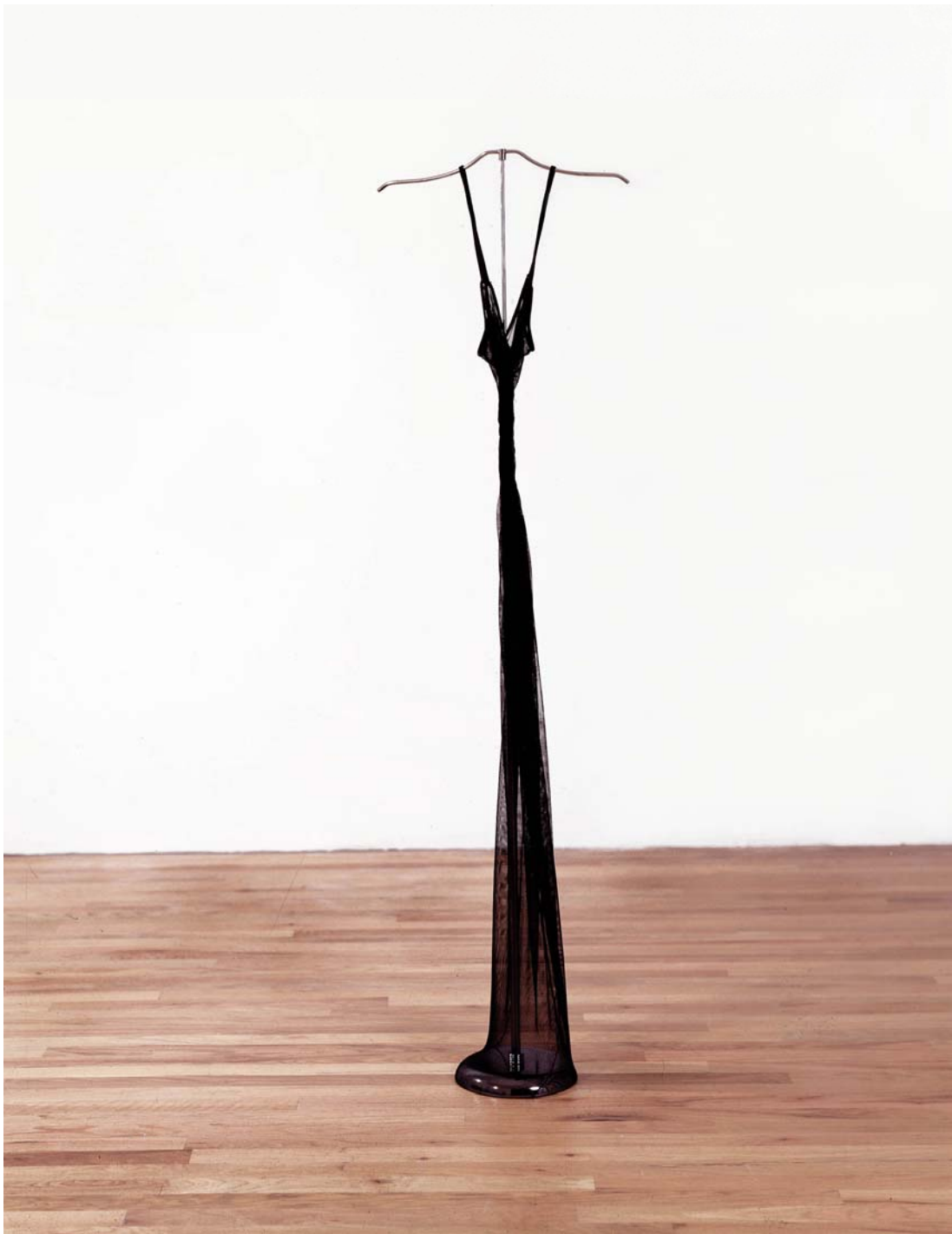
Maureen Connor, Thinner than You , 1990 Steel, nylon, mesh, 60 x 16 x 8 inches